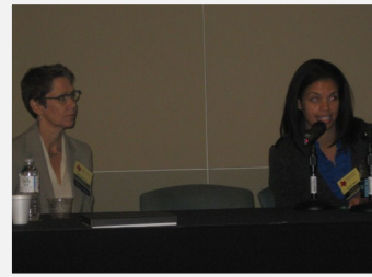
Qualitative Methods in Real World Applications Panel Session

There were continuing education hours offered for CHES and MCHES.