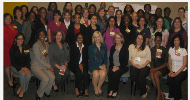
TSOPHE 2011 Conference Members & Attendees

For more information, check out www.tsophe.org .